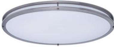
55548WTSN Linear LED Flush Mount