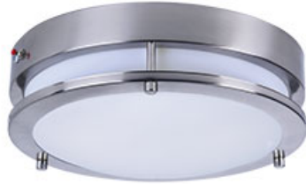
55546WTSN Linear LED Flush Mount