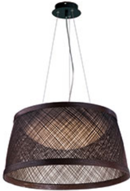
54374CH Bahama 1-Light Pendant