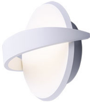
E41385-WT Alumilux LED Outdoor Wall Sconce