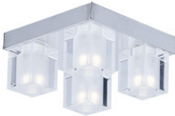
E32038-18PC Bloccs LED 4-Light Flush Mount